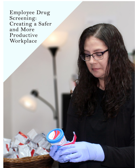
Employee Drug Screening: Creating a Safer and More Productive Workplace